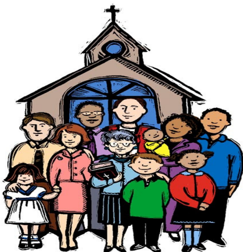
Our Church Family

If you are new to Milford or just have not had the time to register in a parish, this is a wonderful opportunity to become a member of the St. Mary family. There are contact forms in the pews. You can fill one out and drop it in the collection basket and we will call you shortly. Or you can just call the parish house between 8:30 am and 4:00 pm any weekday and we will be glad lead you through the registration process.