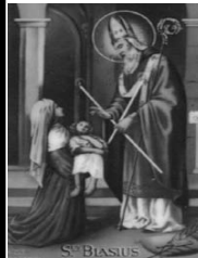
BLAISE OF SEBASTE BM (EM),

The unsettling, transforming challenge is for us to prayerfully meditate upon these words, as a Community of Faith. Can John Paul's vision become flesh and dwell among us?