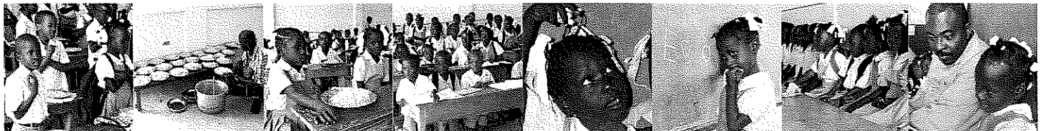
Our Littlest Angels during their lunch time