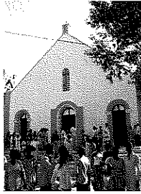
St. Claire Parish Dessalines, Haiti