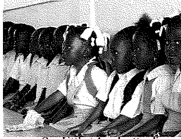
Our Littlest Angels attending school at Claire Lumiere school in Dessalines and eating at St Francis school in the chapel of Fabias