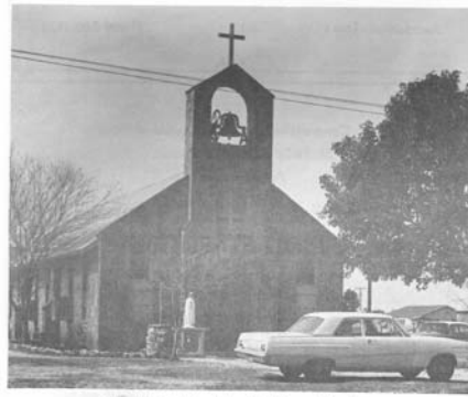
The Immaculate Heart of Mary Church